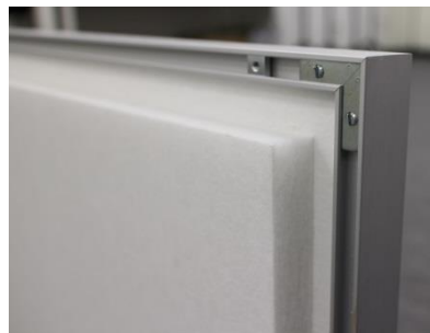
View of back side, doubled