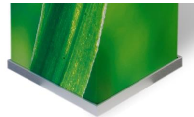
aluminium frame as base bordering (optional)